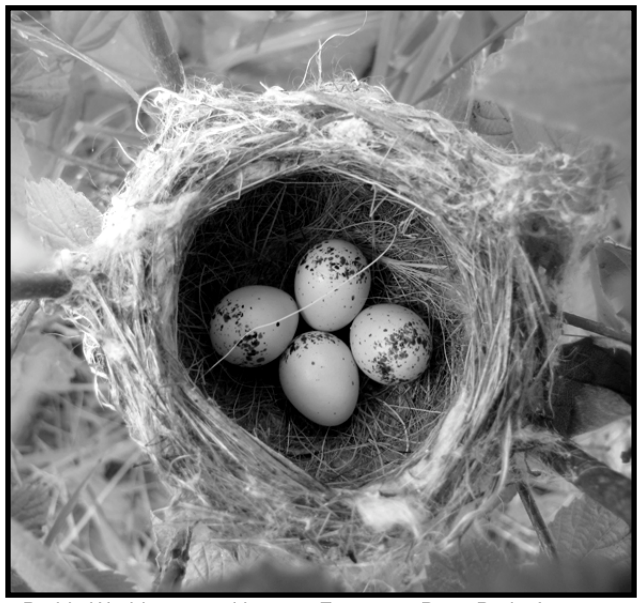
Prairie Warbler nest with eggs, Frontenac Prov. Park, June 2011