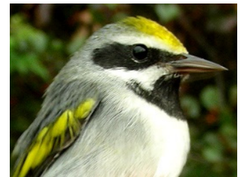
The biggest rarity of the year banded at MBO was this hatch-year male Golden-winged Warbler in mid-September.

2007 was another successful year for MBO, and marked the third year of full operations. Numbers have been quite consistent, with 4121 birds of 84 species banded in 2005, 4265 of 84 species in 2006, and 3657 of 87 species in 2007. The total number of species observed during the year was 165, the highest count yet, though only slightly better than the 164 in 2005 and 159 in 2006. The number of birds banded in 2007 was slightly lower due to a decrease in fall numbers, and the winter banding program not operating. We hope to resume winter population monitoring for 2008-09, but doing so is contingent on funding. In total, we have now banded 103 species and observed 191 species at MBO – impressive numbers for a landlocked site close to a large urban centre. The volume and diversity of species, and their relative consistency from year to year, give us confidence that MBO is a valuable site for monitoring population trends over the long term, while also providing us ample opportunities to pursue research on particular species. Among the projects underway or currently in planning are studies of moult physiology, attempts to refine the accuracy of ageing and/or sexing individuals of certain species, and linking timing of migration to age, sex, and geographic origin.