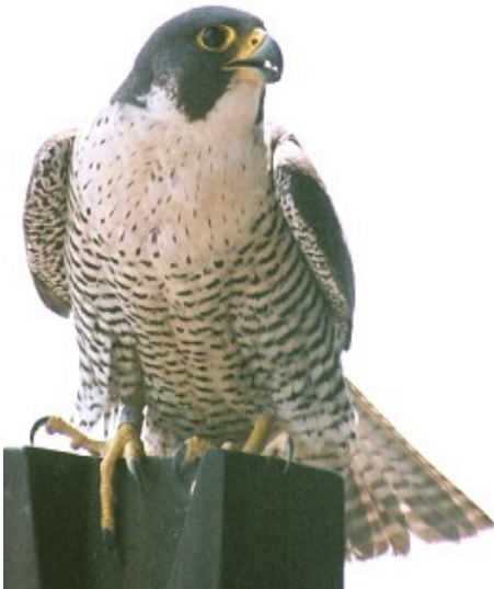
The female adult Peregrine Falcon at the nest on Montreal's Place Victoria, during one of MRF's visits to band her young