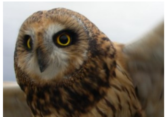
Skor taking flight from her release location in central Saskatchewan. To our knowledge, she is only the fifth Short-eared Owl to be studied using satellite telemetry

Last year, a 12-gram solar-powered satellite transmitter was developed, and MRF purchased one of these. It was placed on a female known as "Skor" undergoing rehabilitation at the Owl Foundation in Vineland, Ontario, where staff were able to closely monitor her reactions to the harness and transmitter, and adapt it to the best possible fit. In October, she was flown out to Saskatchewan, where she had been injured, and we released her near the Last Mountain Lake National Wildlife Reserve, an extensive grassland and wetland complex known to be favoured by Short-eared Owls. After she had spent more than 18 months in captivity following her injury, we were amazed to see that she flew over 1000 km southeast to Minnesota within her first two weeks after release. Another two weeks later she continued southeast to Iowa, and appeared to settle in for the winter in a largely agricultural area southeast of Des Moines. We are very grateful to the Owl Foundation and North Star Science and Technology for their assistance with this project.